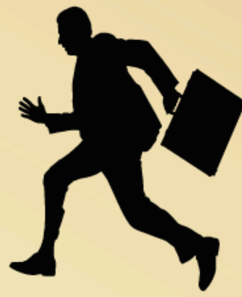
TERRORIST (RUNNING w/I.E.D.)