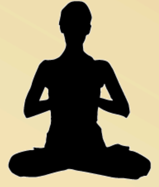
TERRORIST WHO STARES AT GOATS