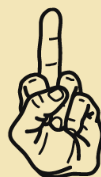
OTHER TERRORIST GESTURE