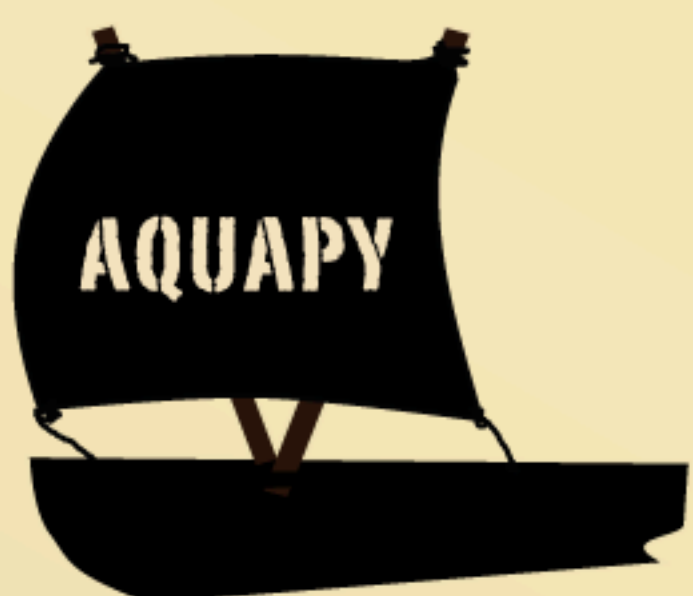
TERRORIST BATTLECRUISER (Oakland, CA)