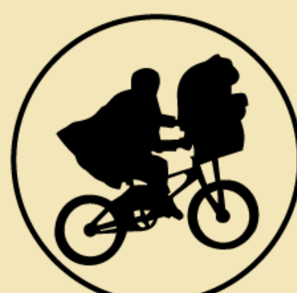
EXTRA-TERRORIST (w/Alien Hover Technology)