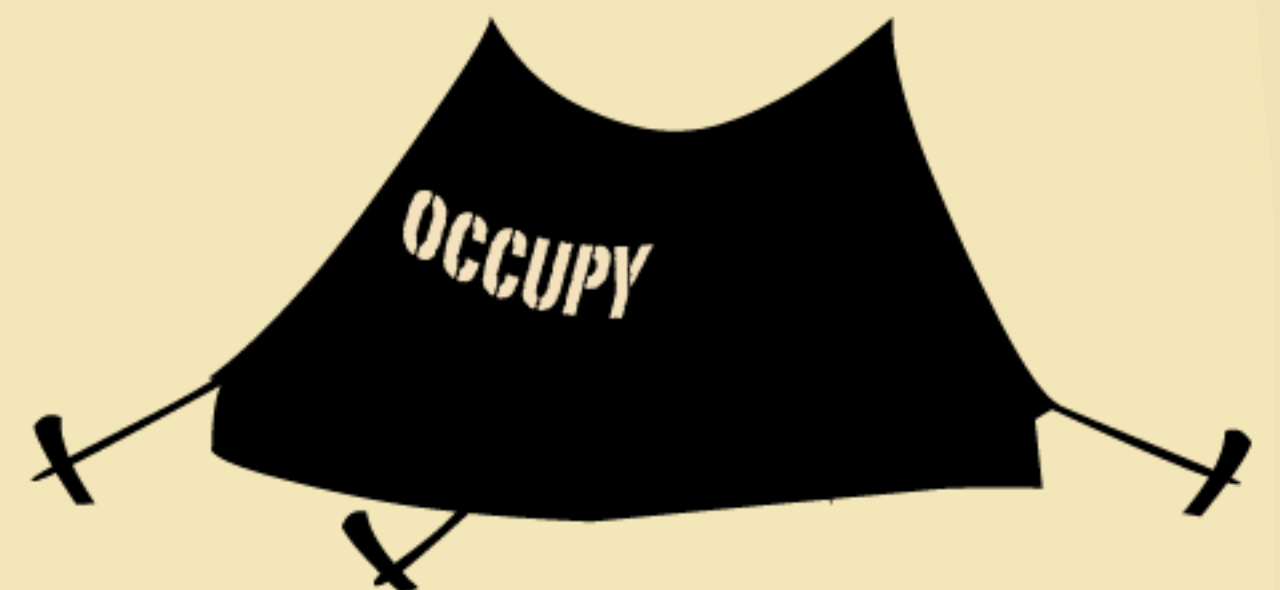
TENT OF MASS DESTRUCTION